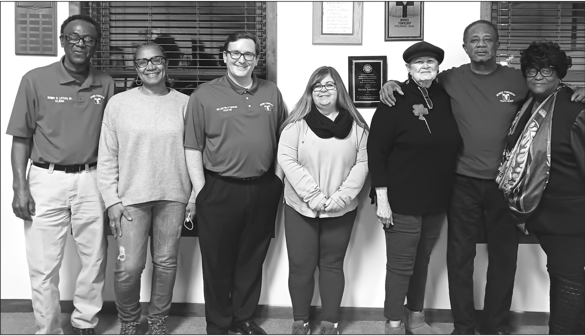
Monee Township Meeting on March 16